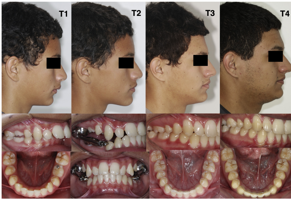
Fig. 2. Patient treated with cantilever Herbst appliance. T1 = before treatment; T2 = immediately after Herbst appliance placement; T3 = at the end of fixed appliance treatment (age 15); T4 = 5 years after treatment (age 20).

intercuspal in the posterior arches will likely preserve a Class I occlusion after treatment by dentoalveolar compensatory mechanisms [38] (Figs. 1–4).