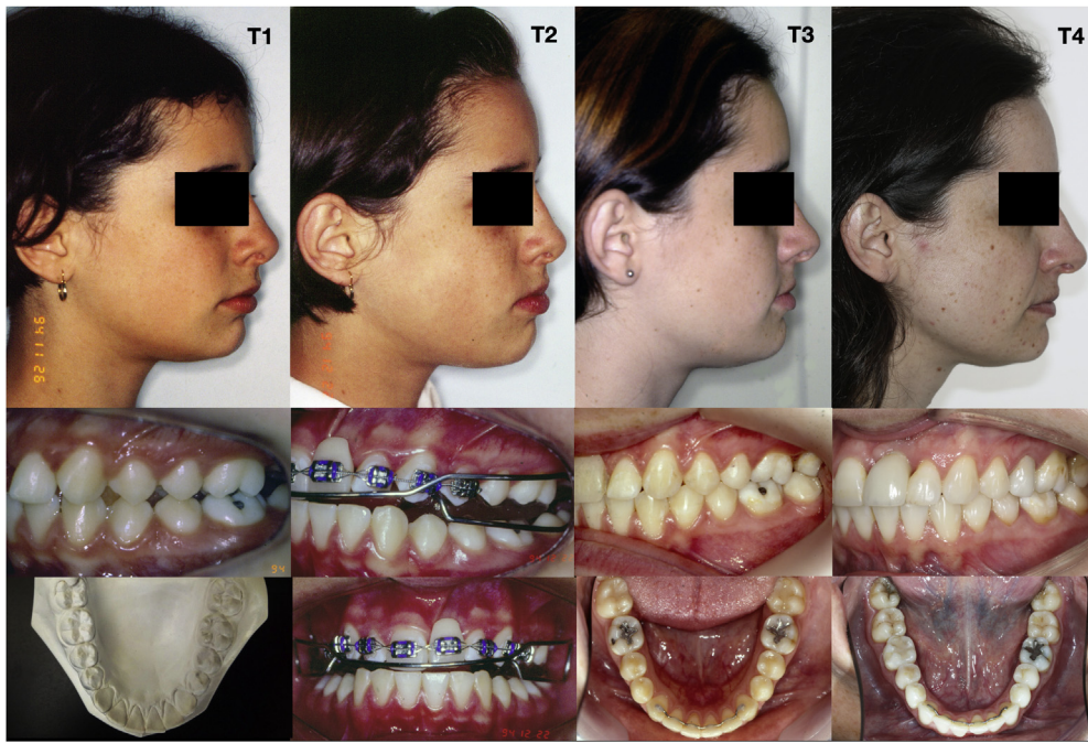
Fig. 4. Patient treated with Bionator. T1 = before treatment; T2 = immediately after Bionator placement; T3 = at the end of fixed appliance treatment (age 16); T4 = 20 years after treatment (age 36).

likely due to physiological aging processes and were not likely associated with functional appliance treatment, as they also occurred in Class I subjects.